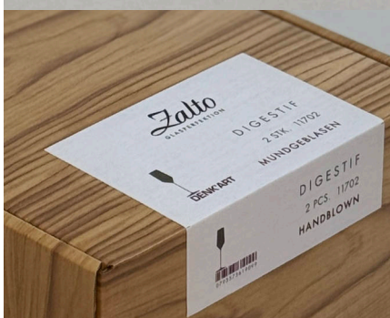
Item No. 11702 Packed in a pack of two