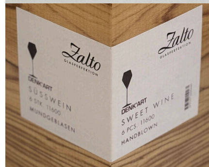
Item No. 11600 Packed in a pack of six

Enhances elegance and finesse. Balances power and sweetness.