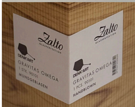
Item No. 90101 Individually Packaged in a Gift Box