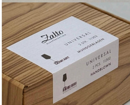
Item No. 11302 Packed in a pack of two