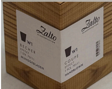
Item No. 70111 Individually Packaged in a Gift Box