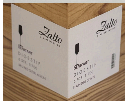
Item No. 11700 Packed in a pack of six

For fine, elegant distillates or liqueurs. Completes the aroma experience with a smooth and fruitfully harmonious finish.