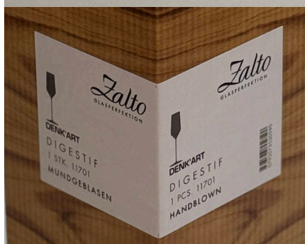
Item No. 11701 Individually Packaged in a Gift Box