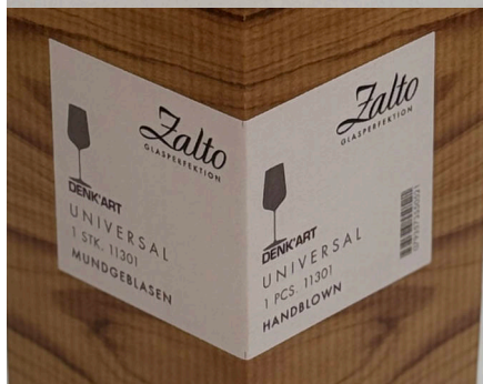
Item No. 11301 Individually Packaged in a Gift Box