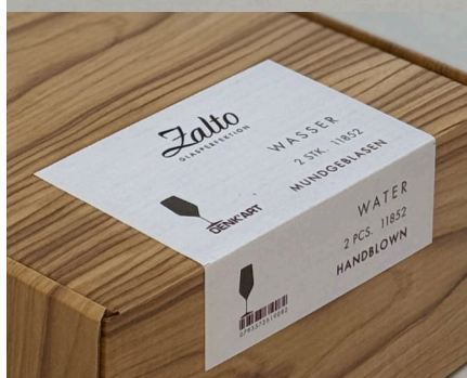
Item No. 11852 Packed in a pack of two