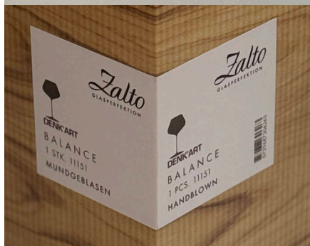
Item No. 11151 Individually Packaged in a Gift Box