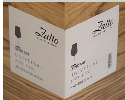
Item No. 11300 Packed in a pack of six

For medium-bodied to full-bodied wines that are expressive yet also mineral and fine.