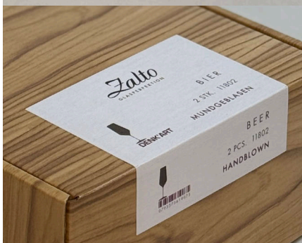
Item No. 11802 Packed in a pack of two