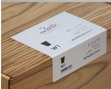
Item No. 70110 Packed in a pack of six

Especially suitable for: Water and non-alcoholic beverages.