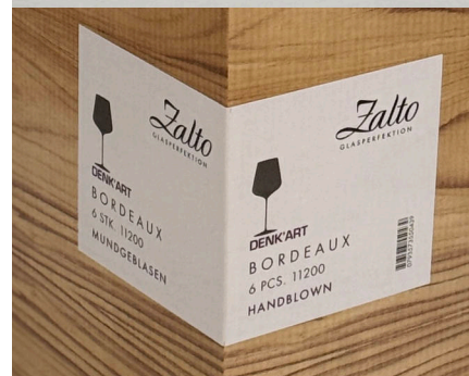
Item No. 11200 Packed in a pack of six

For characterful and tannin-rich red wines. Emphasizes power, density, extract, and tannins.