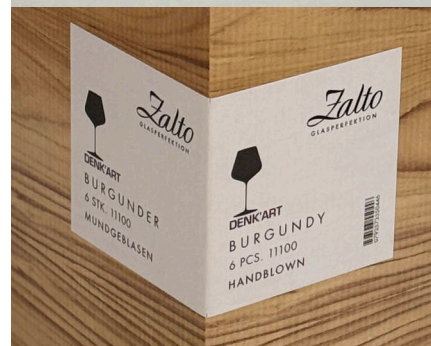
Item No. 11100 Packed in a pack of six

For powerful and expressive wines with over 13° alcohol.