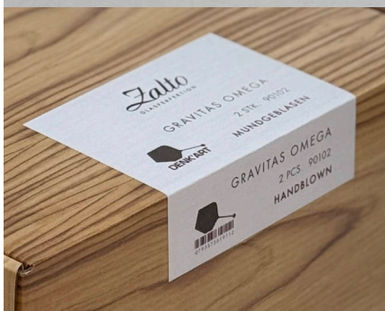
Item No. 90102 Packed in a pack of two