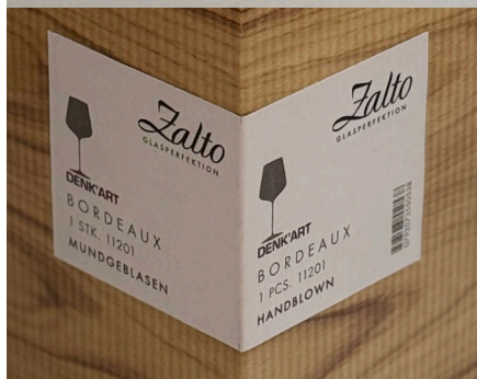
Item No. 11201 Individually Packaged in a Gift Box