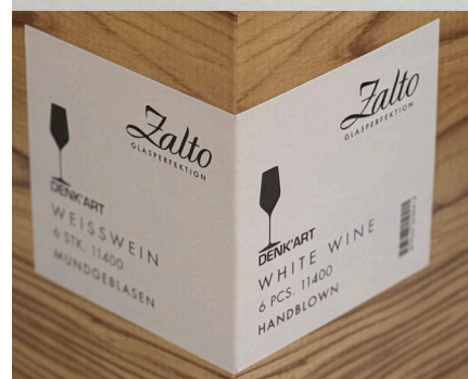
Item No. 11400 Packed in a pack of six

For elegant, classically fruit-driven white wines, as well as medium-bodied red wines without barrel aging.