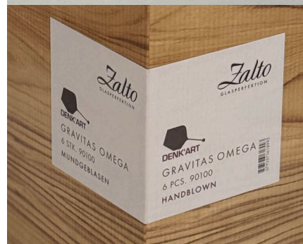
Item No. 90100 Packed in a pack of six

For powerful and expressive wines with over 13° alcohol. Integrates the acidity into the fruit. Enhances the fruit and sweetness components.