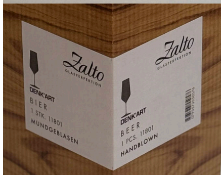
Item No. 11801 Individually Packaged in a Gift Box