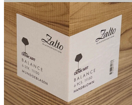
Item No. 11150 Packed in a pack of six

Integrated, balanced, and harmonized without altering the true character traits such as terroir and fruit. For wines that derive their balance and structure from phenolics, tannins, long lees aging, or intentional use of wood.