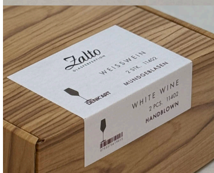
Item No. 11402 Packed in a pack of two