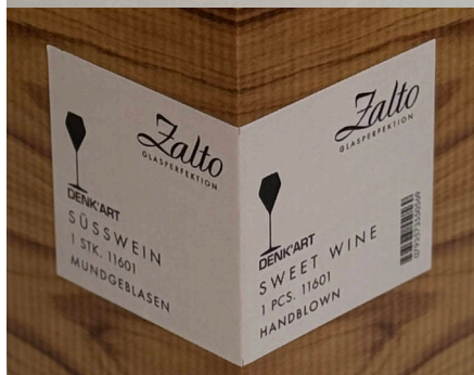
Item No. 11601 Individually Packaged in a Gift Box