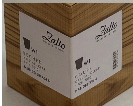
Item No. 70101 Individually Packaged in a Gift Box