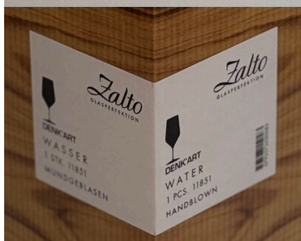
Item No. 11851 Individually Packaged in a Gift Box