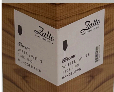
Item No. 11401 Individually Packaged in a Gift Box