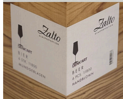
Item No. 11800 Packed in a pack of six

Promotes good and stable foam formation.