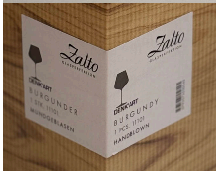
Item No. 11101 Individually Packaged in a Gift Box