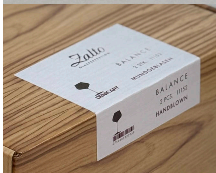
Item No. 11152 Packed in a pack of two