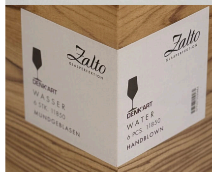
Item No. 11850 Packed in a pack of six

The standard glass that should always be beside the wine glass. Due to its similar shape to a white wine glass, it is also perfect for tasting.