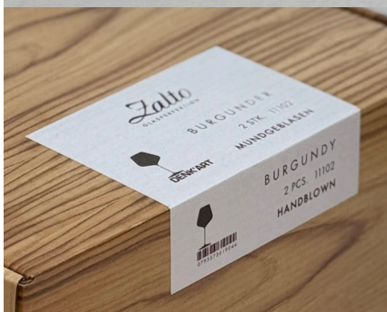
Item No. 11102 Packed in a pack of two