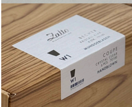
Item No. 70100 Packed in a pack of six

Especially suitable for: Water and non-alcoholic beverages.