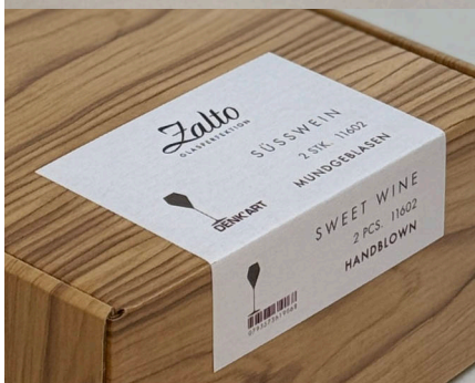
Item No. 11602 Packed in a pack of two